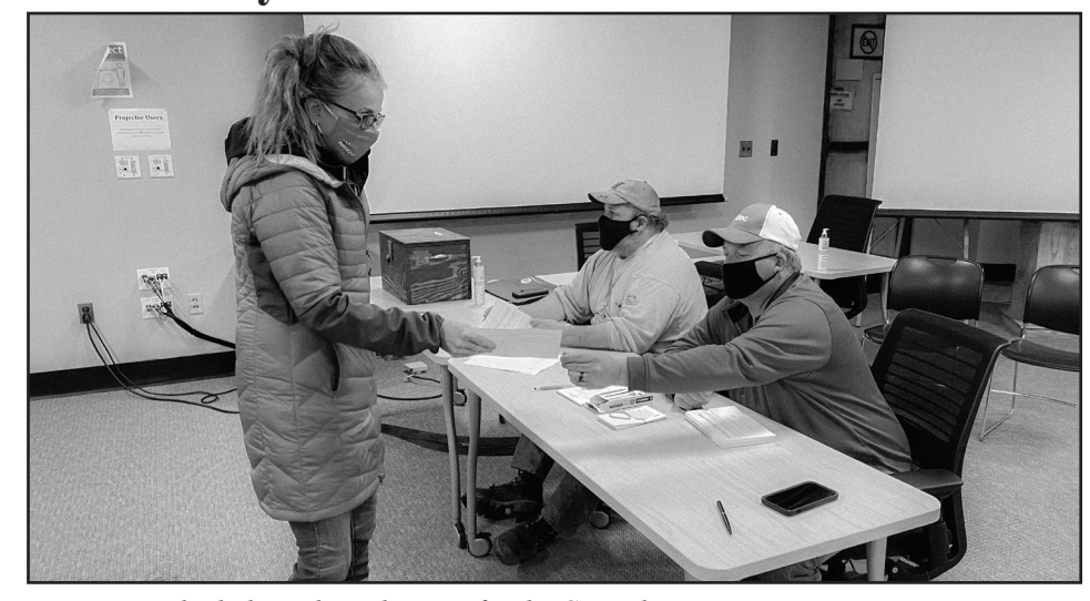
Turnout was high throughout the state for the Central Maine Power contract vote in May.