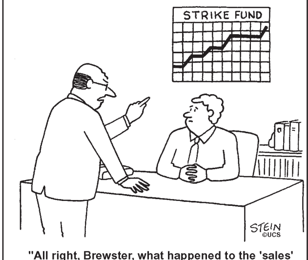
"All right, Brewster, what happened to the 'sales' chart that used to hang on that wall?"

By the same token, when the forecast calls for upcoming contract bargaining at one of our represented companies, members ought to consider getting their financial house in order . . . just in case negotiations turn stormy. All too many of us live from paycheck-to-paycheck, and the threat of missing even a single week's pay can make some of the most resolute union members think twice about the impact loss of wages might have on them and their families.